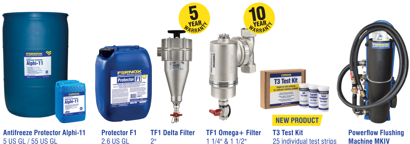
Antifreeze Protector Alphi-11 5 US GL / 55 US GL